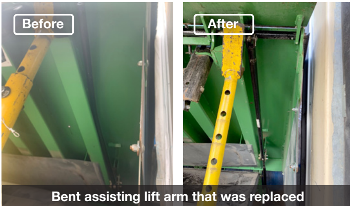
Bent assisting lift arm that was replaced