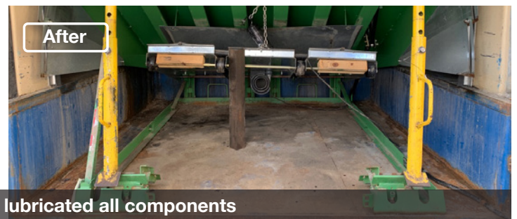
Cleaned pit of debris and lubricated all components