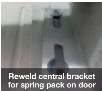
Reweld central bracket for spring pack on door