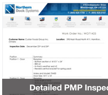
Detailed PMP Inspection Report with photos and list of required repairs