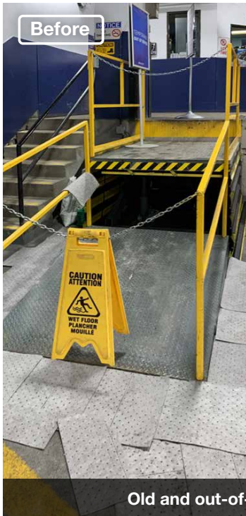
Old and out-of-service dock lift