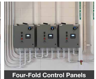
Four-Fold Control Panels