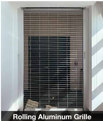
Rolling Aluminum Grille